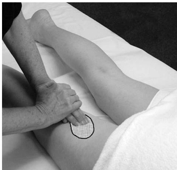
Figure 1 Identification of the area of muscle tightness using longitudinal strokes. (Photograph reproduced with consent)

To execute the dynamic intervention, the subject was moved into a supine position with the hip and knee flexed to 90°. In this position, all dynamic techniques worked the hamstring muscle length from three quarter to end ROM.